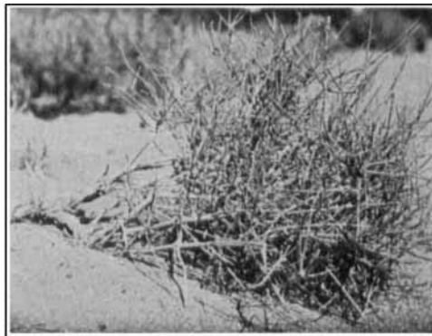
Fig. 4.—Habit photograph showing prostrate individual plant. Ephedra nevadensis .

50 to 90 centimeters in height, and has divergently spreading glaucous green, scabrous branches. Abrams continues describing it as follows (6):