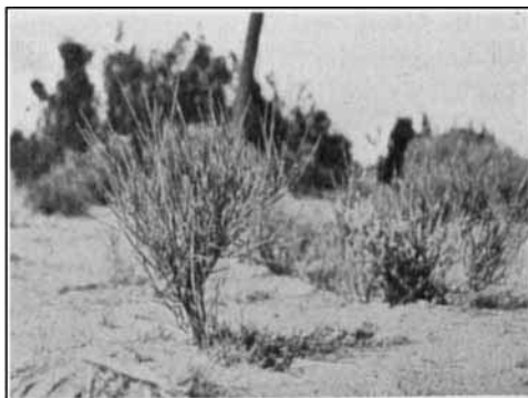
Fig. 2.—Habit photograph of Ephedra nevadensis .