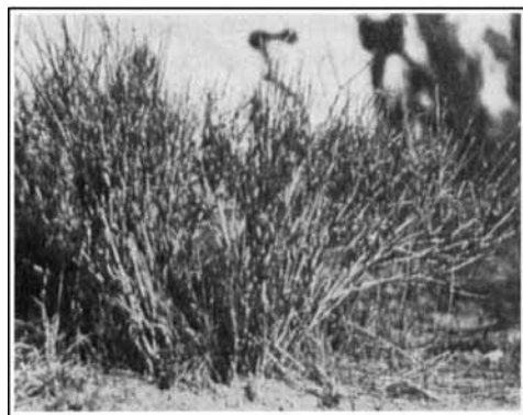
Fig. 3.—Habit photograph of clump of Ephedra nevadensis .